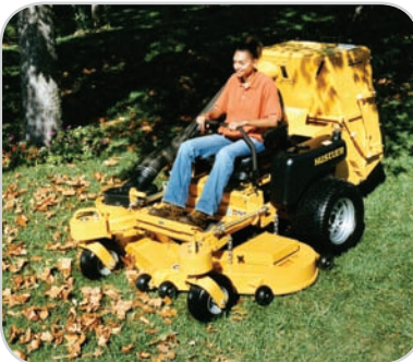
The 9-bushel BAC-VAC™ fiberglass catcher empties from the driver's seat and features a flow-through venting system

At the same time, the Z incorporates all the details of Hustler design, the extra added touches that distinguish this mower from any other Z-rider out there.