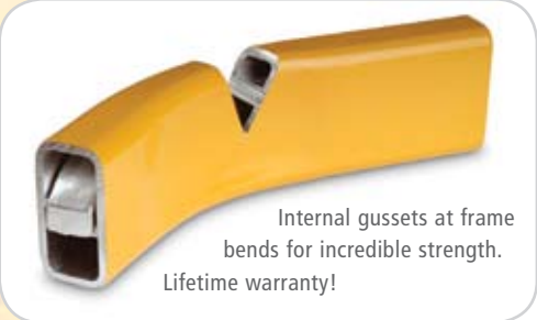
Internal gussets at frame bends for incredible strength. Lifetime warranty!