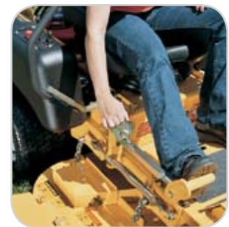
Spring-assisted, foot-operated deck lift for easy adjustment of cutting height or for quick adaptation to curb hopping and trailering

Fusion™ New! Fusion™ blades for less sharpening