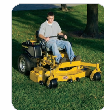
The XR-7 Deck with attached mulching kit for flawless dual side trimming.