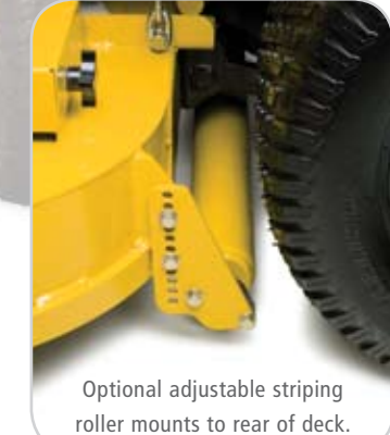
Optional adjustable striping roller mounts to rear of deck.