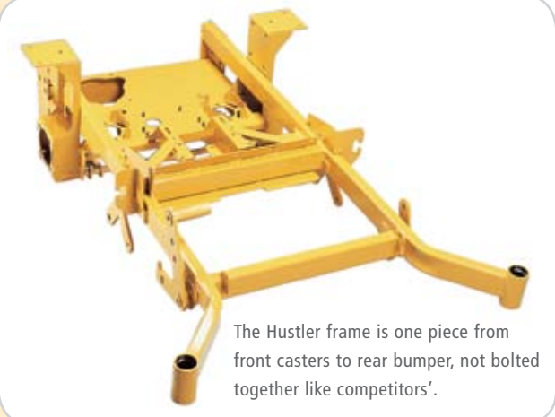
The Hustler frame is one piece from front casters to rear bumper, not bolted together like competitors'.