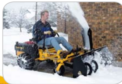
The tough, productive snowblower clears a 48" path.