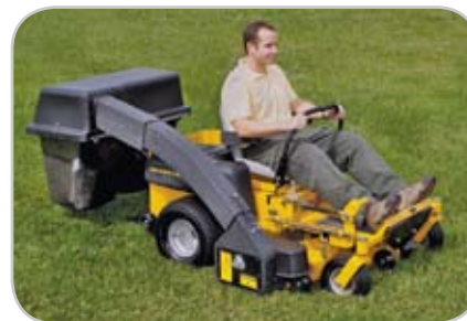
Optional catchers help the FasTrak maintain a professional-quality lawn.